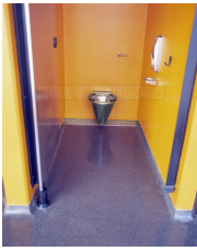
V131 WC pan.