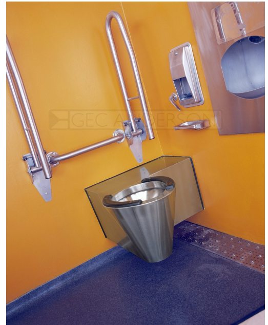
Special DDA compliant corner WC.

Building: The Pavilion, Battersea Park Sector: Local Authority