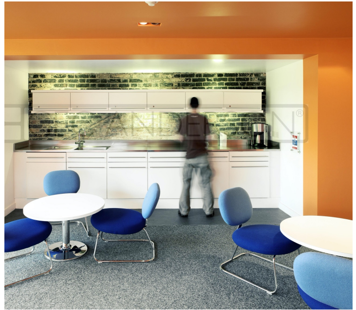
30mm front edge profile (edge 7) and integrated upstand at back and sides