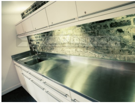
30mm front edge profile (edge 7) and integrated upstand at back and sides