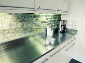
Brushed satin stainless steel worktop