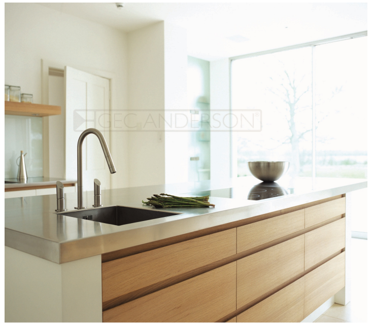
Stainless steel island worktop with 60mm edge profile (edge 7) and integrated single bowl sink

Sector: Kitchen Retail Room Type: Domestic kitchen, Hertfordshire Client: Artichoke