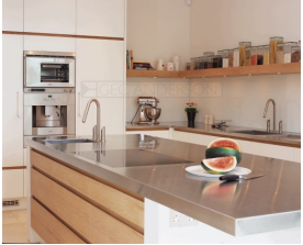
Cantilevered end to island with integral sink and flushmount hob