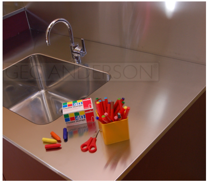
Integrated sink bowl Le50