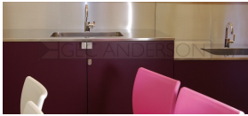
Stepped worktops with 20mm edge profile (edge 7)