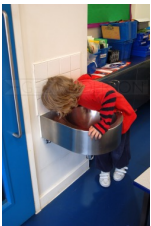
Wall mounted drinking fountain GB4000