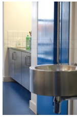
Wall mounted stainless steel drinking fountain GB4000