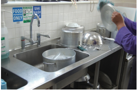
Kitchen worktop with integrated sinks and custom configuration