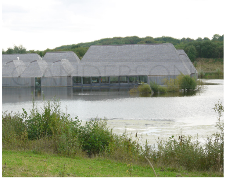
View from the lake.