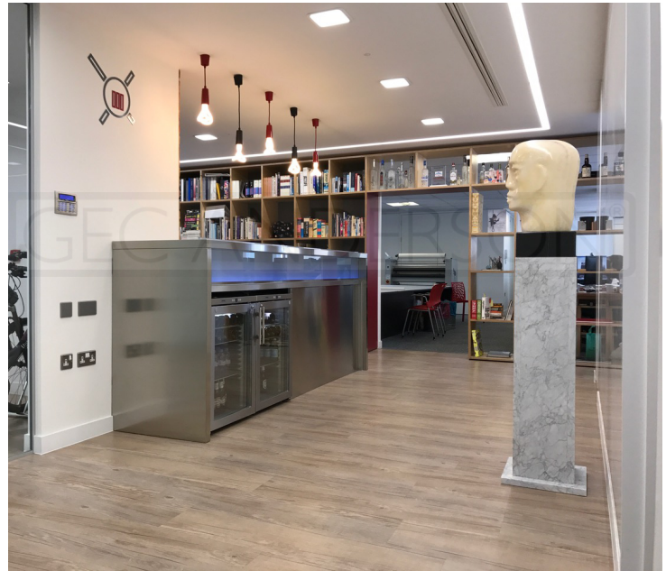
Stainless steel counter and units.

Sector: Marketing Room Type: Kitchenettes / Reception Area Client: Mission Communications