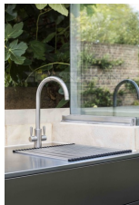
Integrated sink A34