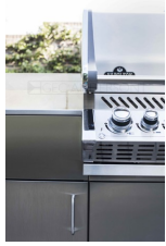
Stainless steel worktop and base cabinets