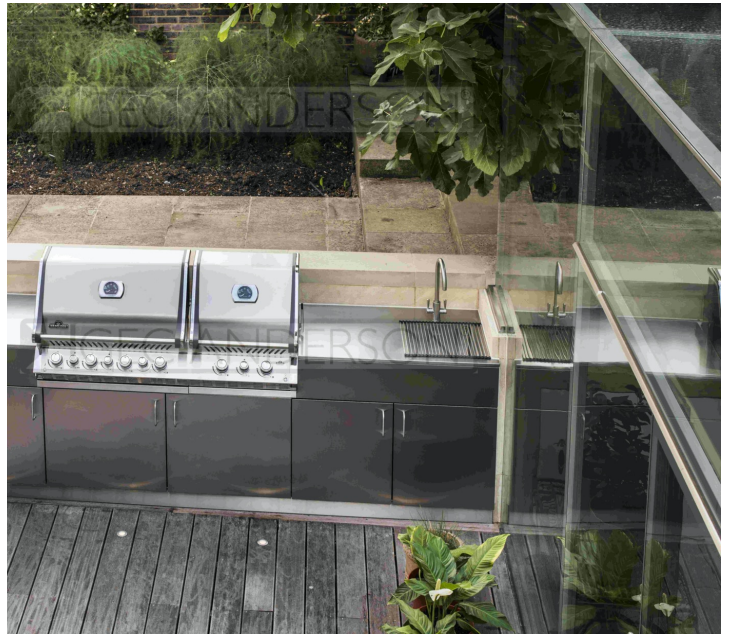
Stainless steel outside worktop and cabinets with lowered area for BBQ unit

Room Type: Outdoor kitchen, Highgate Specifier: Jonathan Freegard Architects