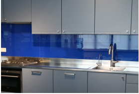
Sinktop with integrated sink, pressed recess, 30mm edge (7) and integral back upstand (edge 10)