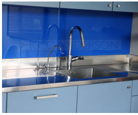
Sinktop with integrated sink, pressed recess, 30mm edge (7) and integral back upstand (edge 10)