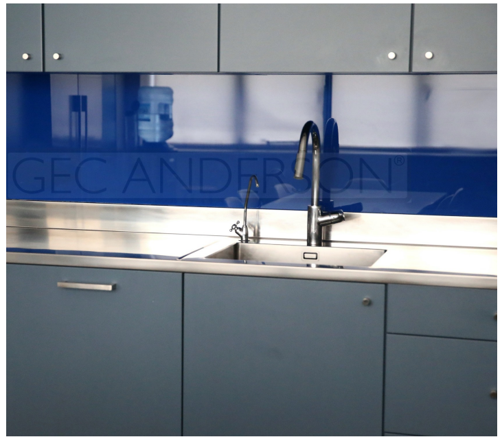
Sinktop with integrated sink, pressed recess, 30mm edge (7) and integral back upstand (edge 10)