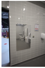
Stainless steel mirrors are made to any size