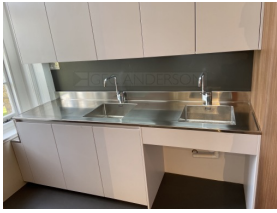
Shaded kitchen with integral upstand and A50 sink and pressed recess