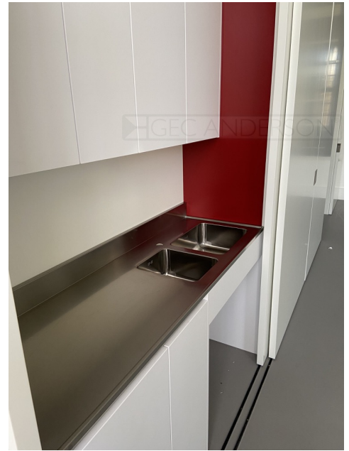
Hideaway worktop with lipped edge (edge 3) and integrated sink bowls