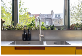
Integral stainless steel sinks and back upstand