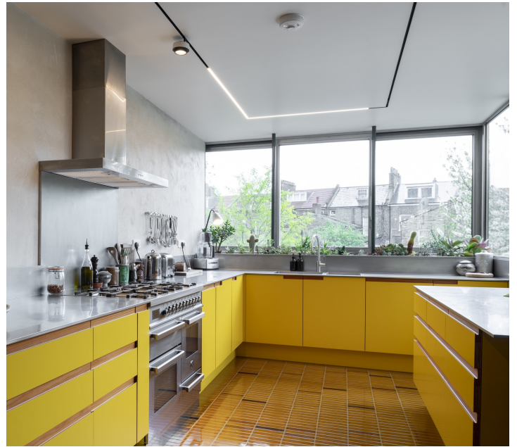
U-shaped stainless steel worktops with extra-thin edge profile and Patina finish

Sector: Private Room Type: Kitchen Specifier: Office Nicholas Ashby