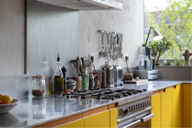
Splashback behind cooker is also fully integrated with worktop