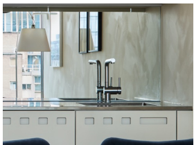
Integral sink bowl