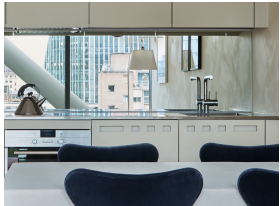
Slimline front edge