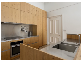
Integrated A45 and A23 sink bowls