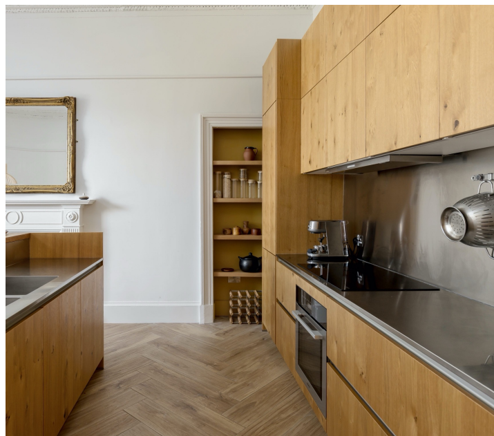
Galley kitchen with stainless steel worktops and splashbacks