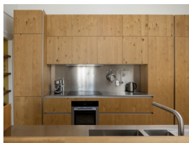
Stainless steel worktops with edge 7 (20mm) and splashback