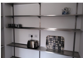
The V90 stepless adjustment system allows for great flexibility