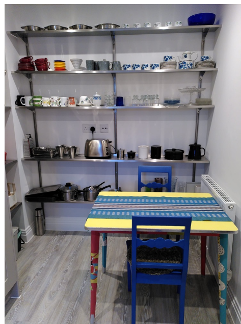
Smart, durable, versatile and attractive

The GEC Anderson 3-part V90 stainless steel shelving system, comprising of shelves, uprights and brackets, can be used to create versatile, durable, hygienic and attractive configurations suited to a wide range of applications.