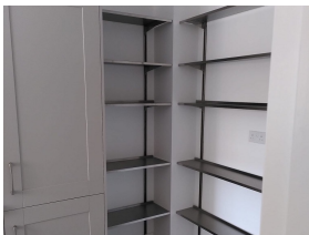
Shelves are made to order in lengths of up to 4000mm